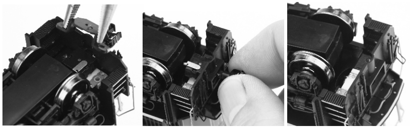
Lift Out Cover Plate & Pull Coupler Mechanism Out Through Pilot Hole