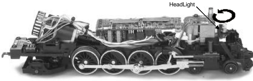
Figure 7. Replacing the Headlight

You can obtain replacement bulbs directly from the M.T.H. Parts Department.