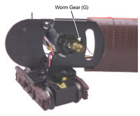
Figure 4a. Grease the Worm Gear