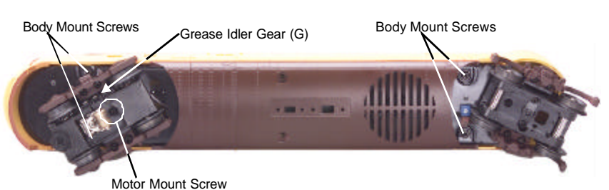
Figure 4. Body Mount Screws and Greasing Points.

It is also a good idea to lubricate the outside truck block idler and drive gears with grease occasionally. Add grease to the points marked with "G" in Figure 4.