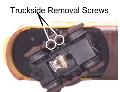
Figure 5. Screws to Remove to Access the Traction Tires

B. Remove the trucks from the chassis and the truck sides from the