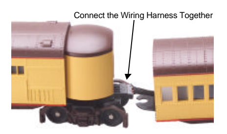
Figure 1. Connecting the Cars Together

In order to disconnect the cars, Simply depress the vestibule and pull the cars apart. Don't forget to unplug the cable.