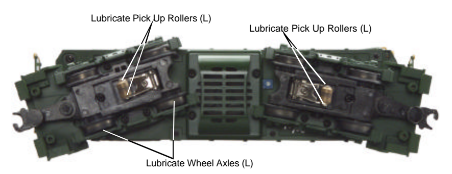
Figure 2. Lubrication Points on the Engine

You should regularly lubricate all outside idler gears and pickup rollers to prevent them from squeaking. Use light household oil and follow the lubrication points marked "L" in Fig. 2. Do not over oil. Use only a drop or two on each pivot point.