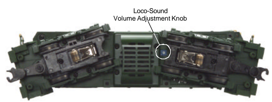
Figure 1. Location of the Loco-Sound Volume Adjustment Knob

Volume Control – To adjust the volume of all sounds made by this engine, turn the master volume control knob located under the engine clockwise to increase the volume and counter-clockwise to decrease the volume (see Fig. 1).