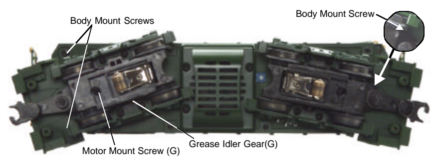
Figure 3. Lubrication Points on the Engine

It is also a good idea to lubricate the outside truck block idler and drive gears with grease occasionally. Add grease to the points marked with "G" in Figure 3.