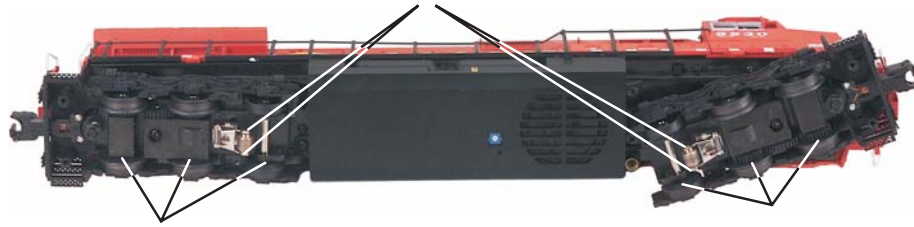
Figure 5. Lubrication Points on the Locomotive

You should regularly lubricate the engine to prevent it from squeaking. Use light household oil and follow the lubrication points marked “L” in Fig. 5. Do not over-oil. Use only a drop or two on each pivot point.