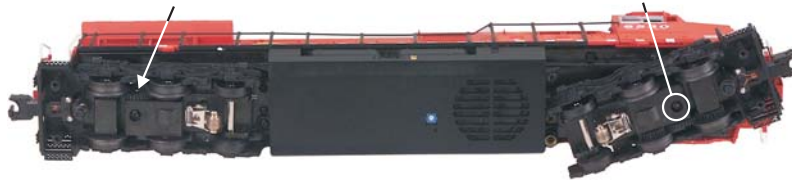
Figure 7. Locations of Greasing Points on the Locomotive

Lubricate the outside truck block idler and drive gears with grease. Use the diagram shown in Figure 7 above as a guide and add grease to the points marked with a “G.”