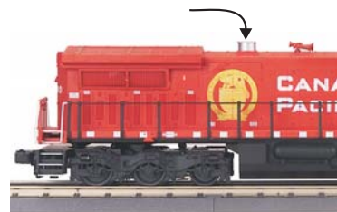
Figure 2. Add Smoke through the Smokestack

When storing the unit for long periods of time, you may want to add about 15 drops of fluid to prevent the wick from drying out.