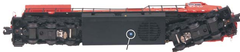
Figure 1. Adjusting the Proto-Sound 2.0 Volume

Manual Volume Control – To adjust the volume of all sounds made by this engine, turn the master volume control knob located under the engine clockwise to increase the volume and counter-clockwise to decrease the volume (see Fig. 1).