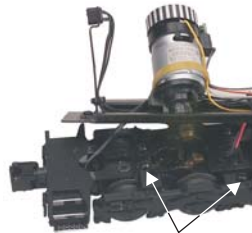
Figure 8. Truckside Mounting Screws to Access the Traction Tires

B. Remove the trucks from the chassis and the truck sides from the trucks in order to slip the new tire over the grooved drive wheel. See Fig. 8 for which screws you must remove to do this.