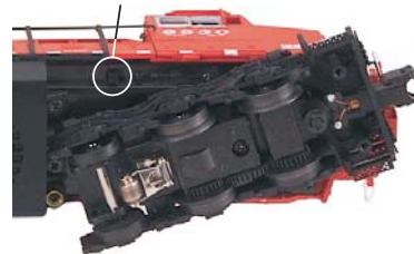
Figure 3. Smoke Unit ON/OFF Switch