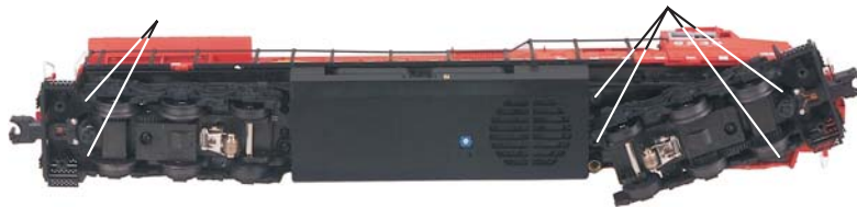
Figure 6. Locations of the Body Mounting Screws

1. To access the gear box, remove the cab from the chassis by unscrewing the chassis screws as seen in Figure 6 and lifting the cab from the chassis.