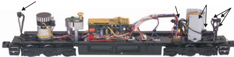
Figure 9. Replacing the Lights in your Engine

Gently disconnect the bulb harness from the socket on the constant voltage circuit and replace the bulb.