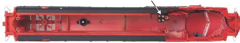
Figure 10. Replacing the Lights Mounted on the inside of the Shell

To replace the lights mounted to the inside of the shell, remove the shell, and slide the spring contact bracket off of its post. Remove the light bulb and wires taking care to notice the path that the wires take on the inside of the shell. Replace the bulb and reassemble the engine.