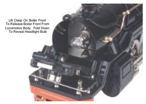
Figure 4: Accessing The Locomotive Headlight

Gently unscrew the bulbs from the socket on the mounting bracket and replace the bulb.