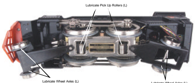
Figure 1. Lubrication Points on the Locomotive

Make sure you lubricate all side rods, leading and trailing trucks and drive wheel axles.