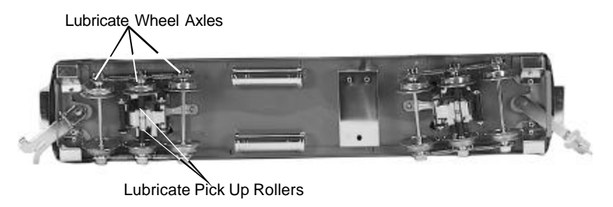
Fig. 1 Lubricating the Passenger Car

Use a light household oil for lubrication. Apply oil sparingly, using a toothpick or small applicator. Add a drop of oil to the axle holes in the front and rear of each wheel, to each side of the pickup roller axle, and above and below the clip on the coupler arm pivot (see Figure 1, below). Wipe away excess oil with a cotton swab.