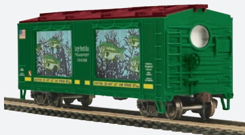
Large Mouth Bass - Operating Action Car 81-99008 $54.95