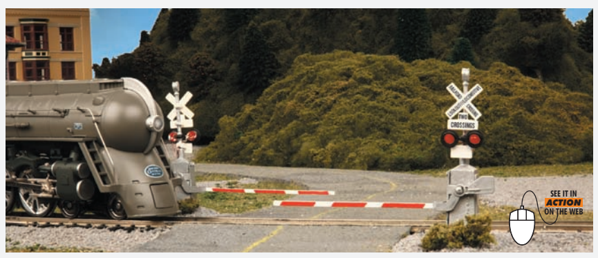
Operating Crossing Signals 80-10001 $179.95