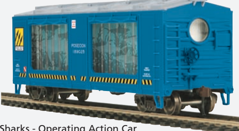
Sharks - Operating Action Car 81-99007 $54.95